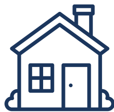
Housing and home repair costs