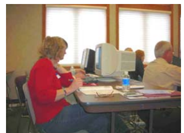
Families work to complete the FAFSA