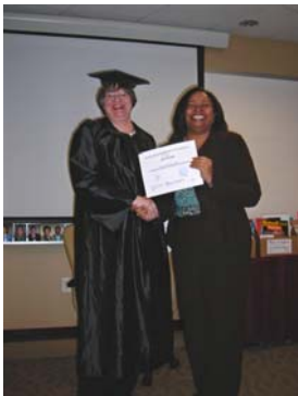
ScholarShop Training Attendees Graduate with Honors from the Indianapolis Training Session.